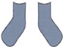
Boy's/Girl's Socks $5

Do you want to help with a different item? $_____