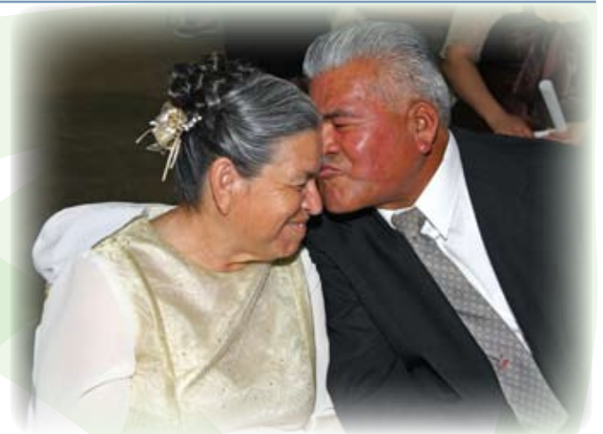
Still lovebirds after half a century