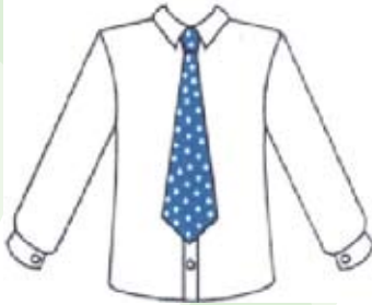
Boy's/Girl's Long Sleeve Shirt/Sweater $25