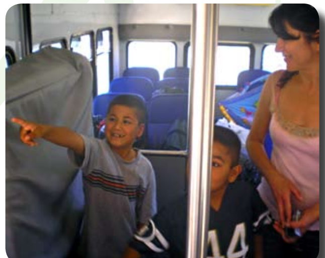
The kids enjoyed the bus