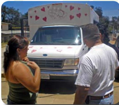
The Love Bus, covered with hearts, was a big surprise and blessing